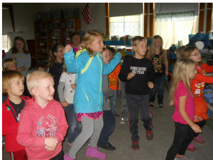
K & 3rd grade reading buddies dancing